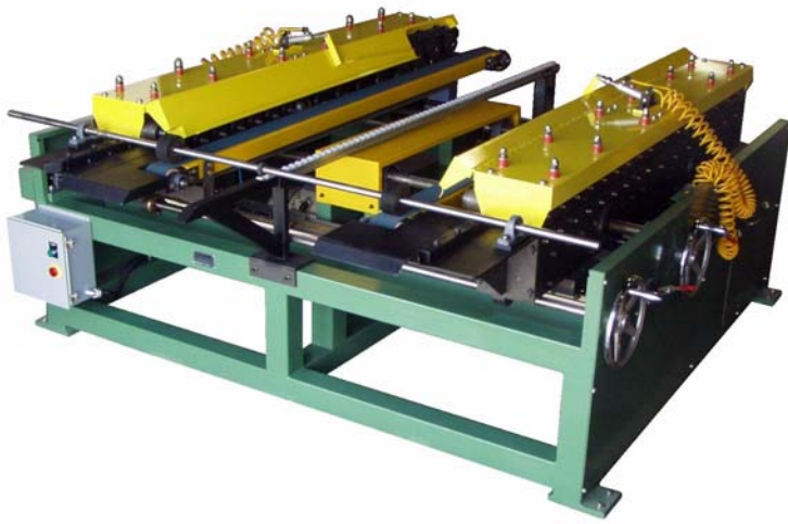
Figure 2: Model # DY16-TDFC-DH Dual Head Rollformer can be used as a free standing unit or installed inline with any Duct Fabrication System. The Unit will form the TDFC Flange on both ends of the duct in a Single Pass Through Operation. Variable to produce a standard 4' through 5' long duct.