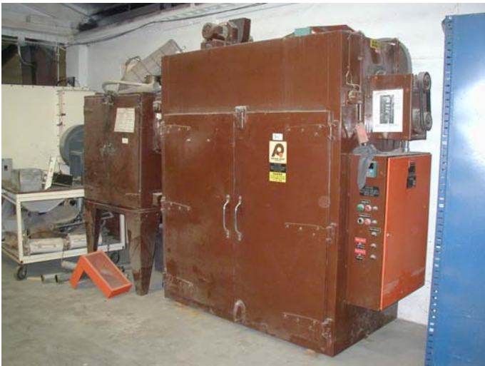
Figure 3: Complete Powder Coat Spray System