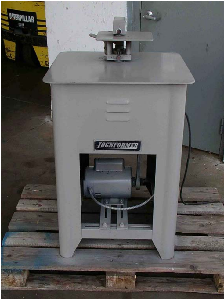
Figure 1: Power Flanger

Lockformer Power Flanger forms button punch snap locks in a simple two step process.